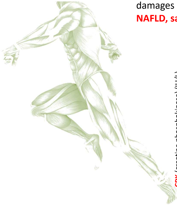
Comparison between CPK (Blood) and Titin-N (Urine) after 4 hours physical body stress

Titin (connectin) is a protein that consists of 34,350 amino-acid (3,816kDa) and specifically expresses in a cross-striated muscle. Titin has been known as the largest protein among of existing proteins in a living body. It has been researched in the field of muscular damages such as sports medicine, cardiac disease, NAFLD, sarcopenia and frailty etc.